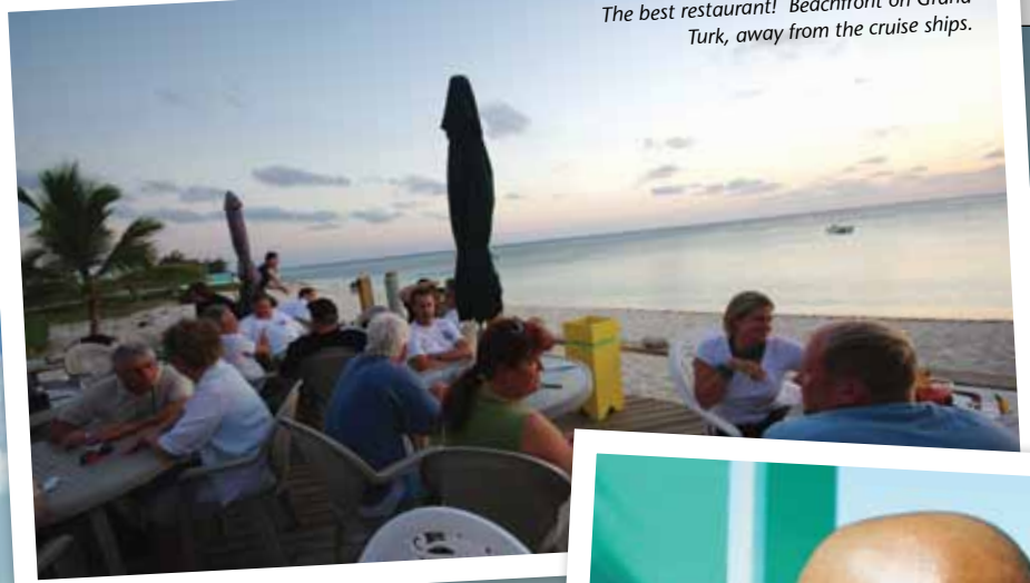
The best restaurant! Beachfront on Grand Turk, away from the cruise ships.

Grand Turk is listed among the world's top diving locations, and though diving and flying don't usually mix, a shallow dive at 70ft and a 45 minute flight 24 hours later at 2,500 ft to Provo proved no problem.