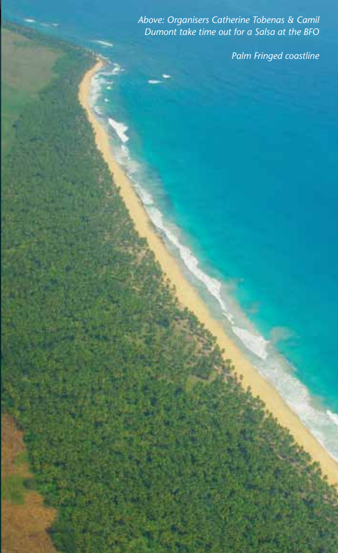
Palm Fringed coastline

Puerto Rico is U.S. territory – some locals hope it will be annexed to the United States. Others hope for independence. It currently lies somewhere in between, but there was no doubt we were back under American influence as we were greeted on the tarmac by a (friendly enough) sniffer dog, a bomb detecting Geiger-counter, and then watched in surprise as one of the aircraft whizzed by attached to a small tractor. This, we later learnt, is the most efficient method of transferring aircraft from the customs apron down to the FBO apron. For a casual Aussie it all seemed a bit surreal.