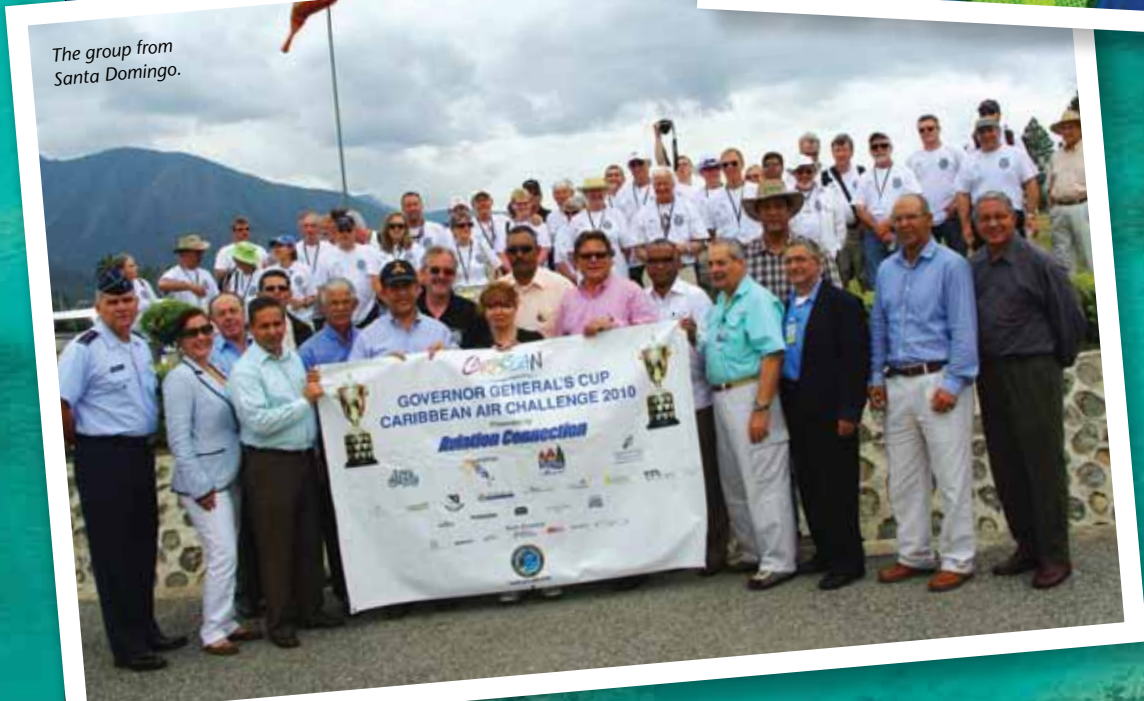
The group from Santa Domingo.